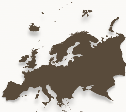
UK Europe & Scandinavia