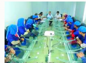
Worker and management meeting