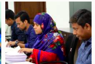
Employee of IRIS