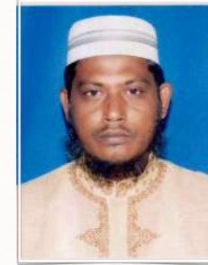
Director Admin & Finance