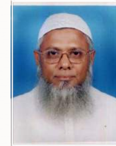
Director Knitting & Dyeing